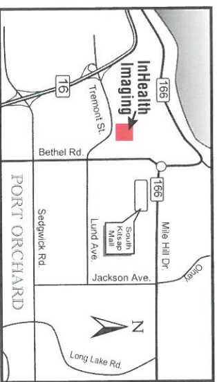
Port Orchard Imaging & Women's Screening Center